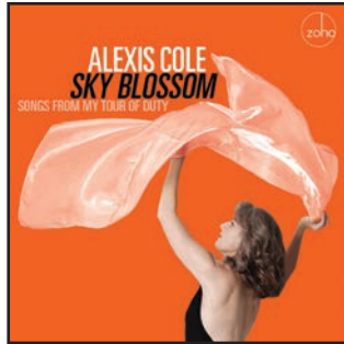
ALEXIS COLE Sky Blossom Songs From My Tour of Duty ZM 202108 Street Date: November 5, 2021