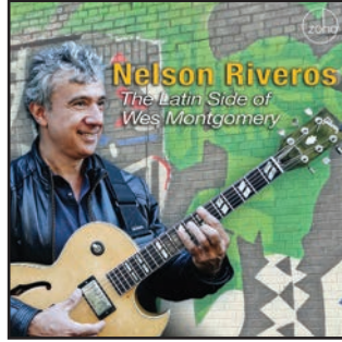
NELSON RIVEROS The Latin Side of Wes Montgomery ZM 202103 #7 IN JAZZWEEK 2021 TOP 100 Street Date: February 5, 2021

CD 8 80956 21012 4 180 GRAM VINYL 8 80956 21022 3