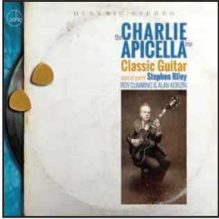
CHARLIE APICELLA TRIO Classic Guitar ZM 202101 CD AND 180 GRAM VINYL Street Date: January 15, 2021

CD 8 80956 21012 4 180 GRAM VINYL 8 80956 21022 3