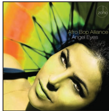
AFRO BOP ALLIANCE with guest Paquito D'Rivera Angel Eyes ZM 201408 Street date: September 9, 2014